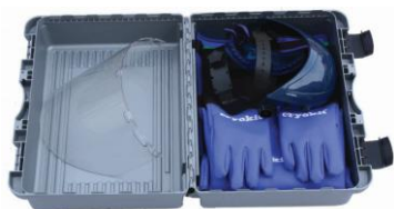
Cryogenic safety equipment