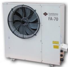
AIR COOLING UNIT