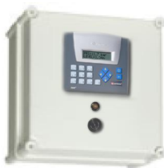
O 2 depletion alarm