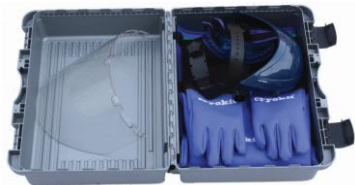
Cryogenic safety equipment